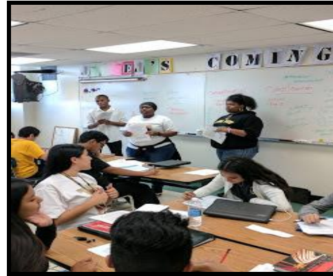
YMS/WLP engage students in dialogue regarding LGBTQI youth & sexual assault awareness

On Denim Day , April 26, 2017, 10 th , 11 th and 12 th grade students from the Women's Leadership Project (WLP) and Young Male Scholars' (YMS) programs at Gardena High School and King Drew Magnet of Medicine and Science conducted sexual assault and sexual harassment prevention workshops with over one hundred and twenty students in health, math, social studies and Advisory classes. The WLP and YMS programs are part of the L.A. County Human Relations Commission's violence prevention and education initiatives for youth. During the presentations, students discussed the prevalence of sexual violence and harassment on school campuses and communities, the stereotypes associated with rape and sexual assault victims, and the normalization of violence against women and girls of color in mainstream society. Despite being marginalized in mainstream media representations of sexual violence victimization (which tend to foreground the experiences and lives of white victims), African American women have some of the highest rates of rape and sexual assault. Nearly 60% of black girls have reported sexual abuse victimization by the age of eighteen. The pervasiveness of rape and sexual violence in the U.S. has been characterized as an example of " rape culture " by anti-violence activists.