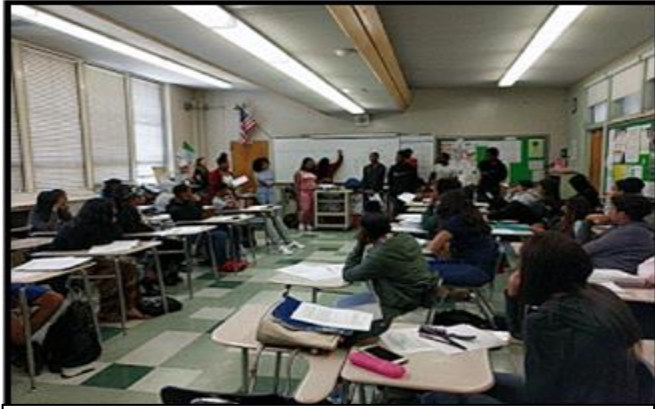
WLP/YMS leaders engage their peers in an interactive to help understand and dispel misconceptions about sexual assault

happen across gender identity and sexual orientation. They were also informed about the low rates of reporting among African American women violence victims, the prevalence of social media predation, cyberbullying and sex trafficking, as well as recent high profile examples of sexual harassment